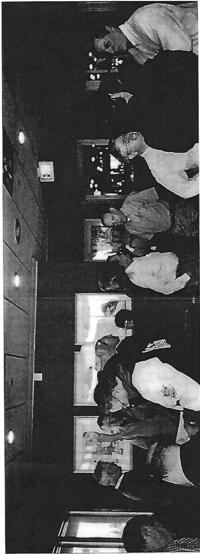
Alumni Breakfast – 1 May